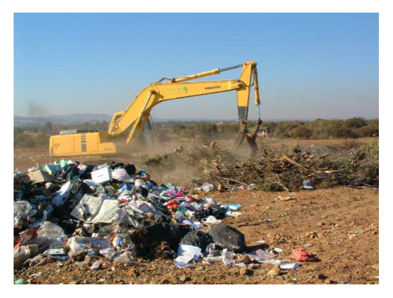
Figure 5 Collecting roughage and waste

As mentioned in the introduction, a method was sought which would solve the incredible waste disposal problems in rural South Africa and at the same time be sustainable by being financially attractive. It was therefore imperative that the windrow should be built using only equipment which would be available on a landfill, and not the specially built equipment used at, for example, Cottbus. Even so, it should be kept in mind that many rural communities would not even have the means to purchase the most basic of landfill machinery, so would have to build such windrows using manual labour and hand tools.