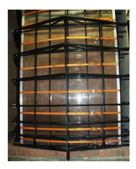
Figure 14 The lysimeter

On breaking up the windrow the material had no odour, and looked remarkably similar to commercially available compost, except that it contained very high proportions of plastics, glass and metal containers.