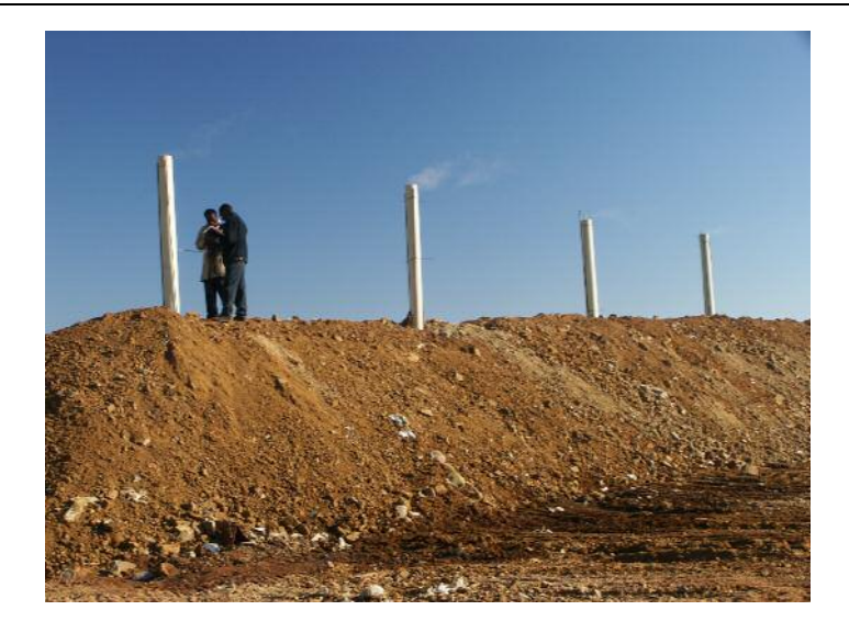
Figure 11 Completed windrow

When the windrow was finished, it was covered by a 200 mm layer of the soil used as daily cover on the landfill. At Cottbus the purpose of the cover was probably to protect the composting waste against excessive heat loss to the cold environment; at Hatherley its purpose was probably more towards protecting the waste from excessive water loss through evaporation into the warm and dry Pretoria climate. The windrow was constructed during winter when the daily temperature was varied between about 7° C at night up to around 17° C by day. It was broken up in mid-summer when the temperature varied between around 16° C and 28° C. Figure 11, which shows the completed windrow, also shows some leachate flowing from the windrow as well as some steam coming from the chimneys.