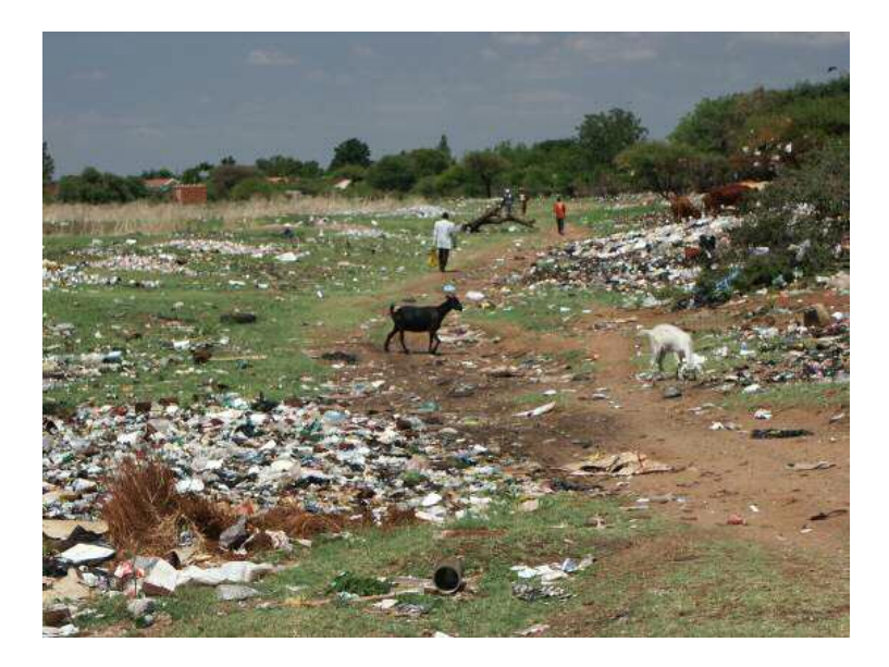
Figure 2 Rural waste disposal in South Africa

in 2005. In the country's economic heart, the province of Gauteng, and in the other major metropolitan areas such as Durban and Cape Town, municipal solid waste is disposed of in state-of-the art landfills which are properly designed and managed. These landfills probably handle a major proportion of the Municipal Solid Waste (MSW) generated in South Africa, but they nevertheless number only about 600 out of the estimated total of 15 000 refuse dumps scattered all over the country.