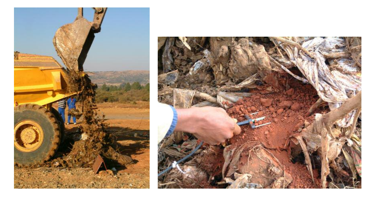
Figure 9Starting the windrowFigure 10Inserting TDR probe

This waste was then once again being loaded onto the tipper truck and transported to the adjacent site where the real windrow was being built. In this case the waste was dumped in position by the tipper, with a normal excavator being used to postion it correctly in relation to the aeration channels and ventilation domes.