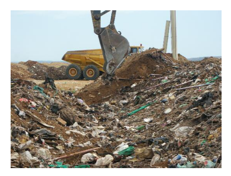
Figure 13 Breaking up the windrow

Finally, after some 4 months, the windrow was broken up (figure 13) and some of the waste was transferred to a 4,5 m deep lysimeter in the laboratory (figure 14) for further analysis.